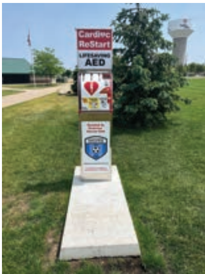
Double sided install