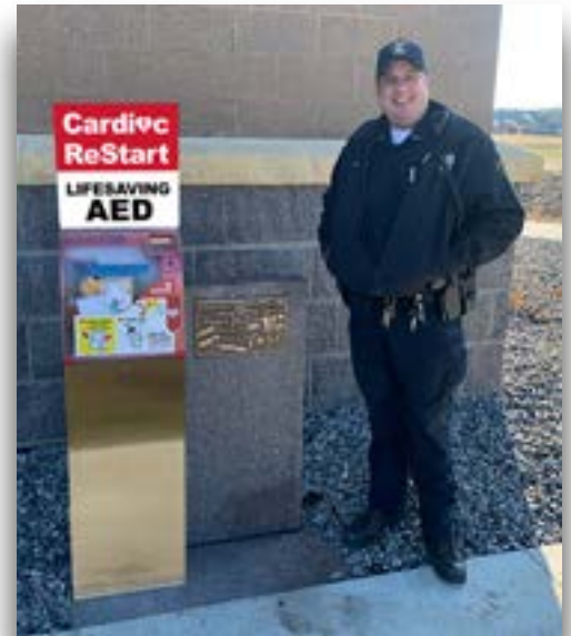
Single sided install against a building/structure