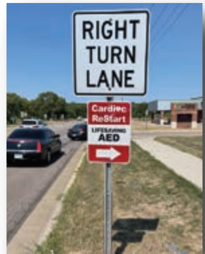
Text & Image