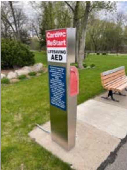
Double sided install