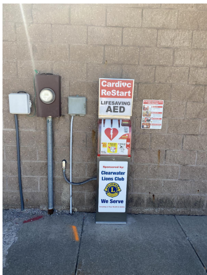
Clearwater Lions Park