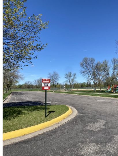
Highly visible Directional Signs at Whitney Senior Center