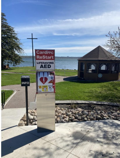
Morning Glory gardens on Long Beach