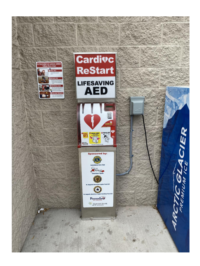
St. Augusta Dollar General