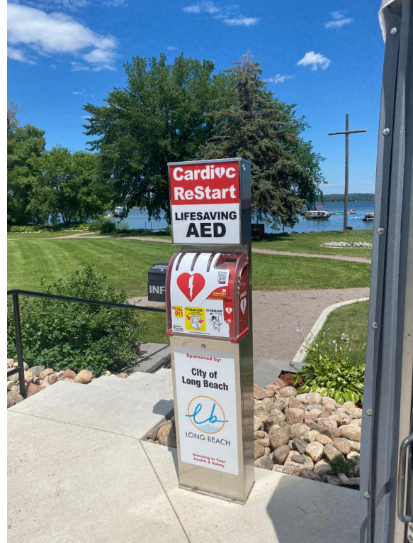
Morning Glory Gardens- Long Beach, MN