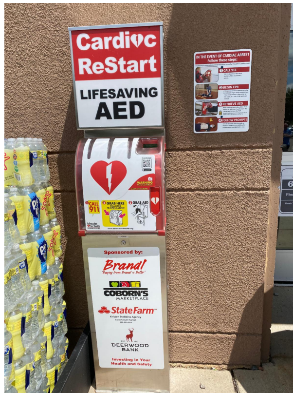
Coborn's Sartell, MN