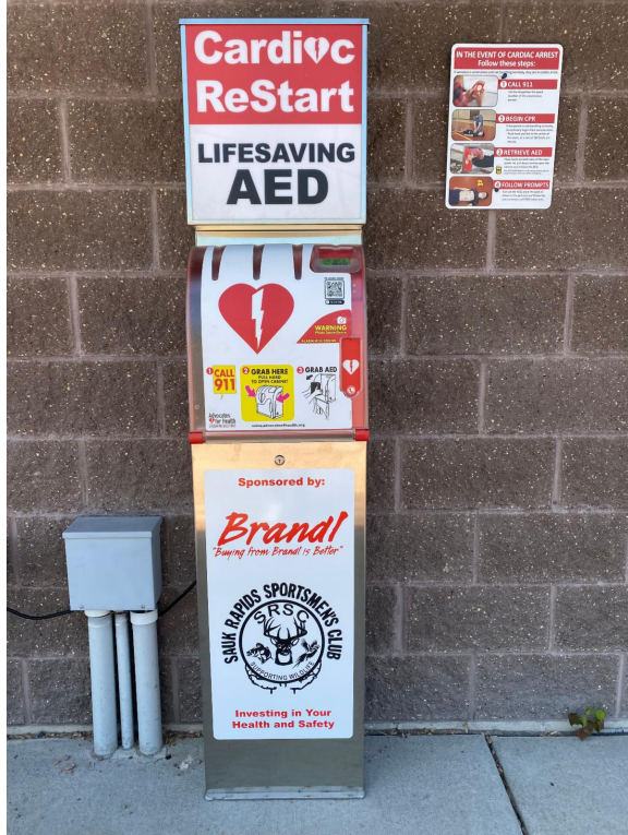
Sauk Rapids Middle School Athletic Complex- Sauk Rapids, MN